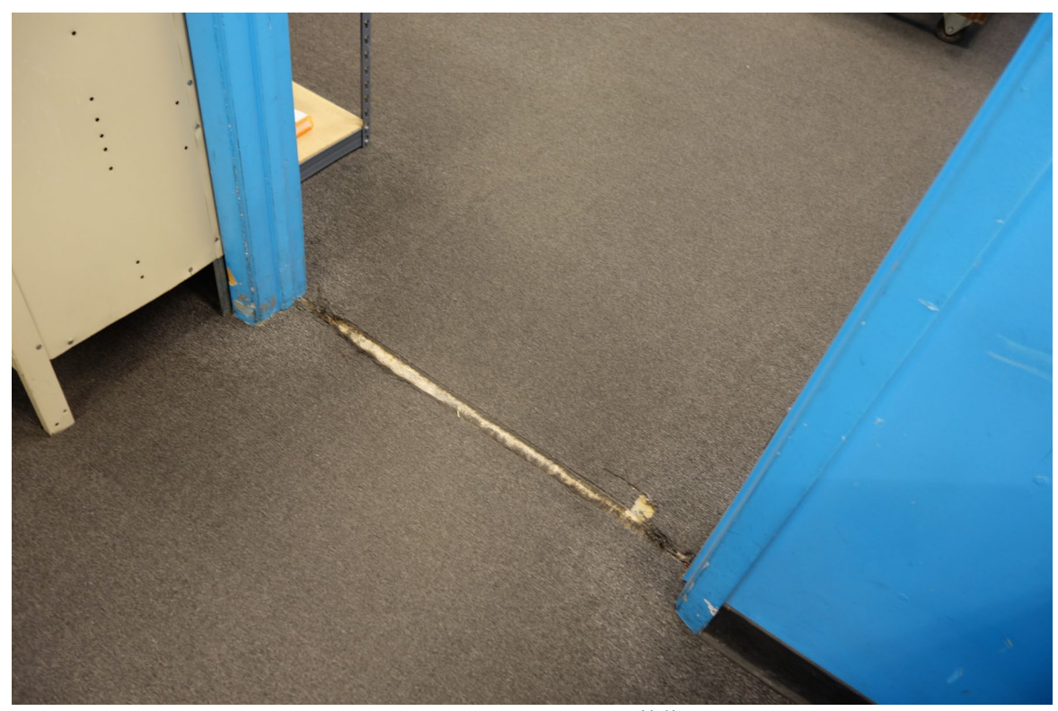
B&G HVAC Garage – FCA Building #2062 Description: Flooring Replacement Needed.