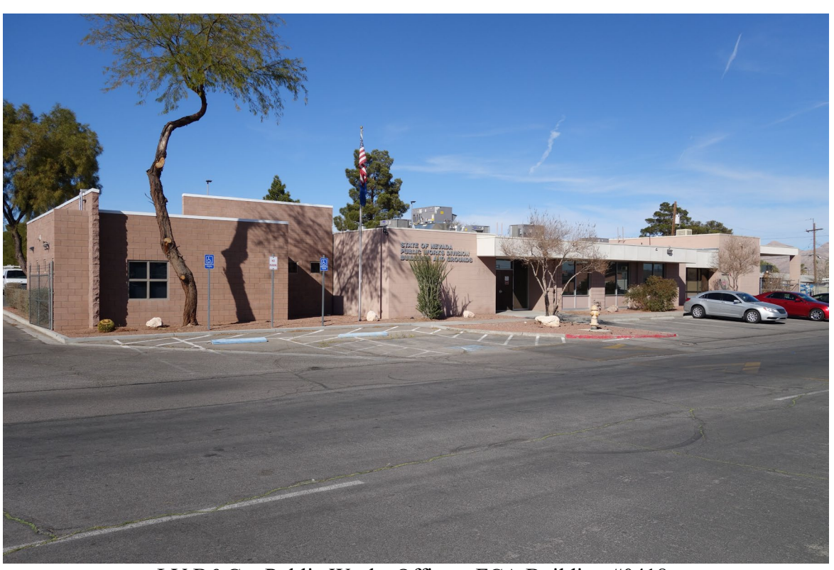
LV B&G – Public Works Office – FCA Building #0418 Description: Exterior of the Building.