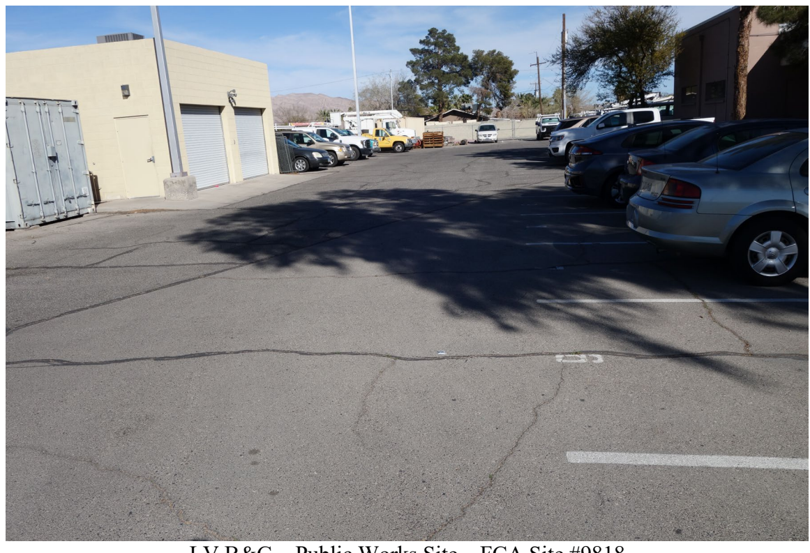
LV B&G – Public Works Site – FCA Site #9818 Description: View of Parking Area Behind Office.