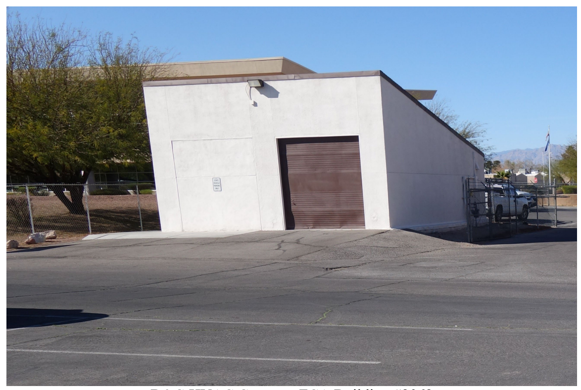
B&G HVAC Garage – FCA Building #2062 Description: Exterior of the Building.