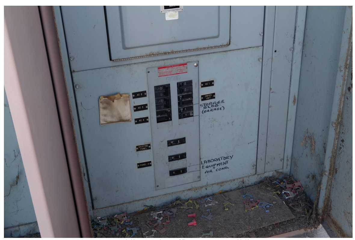
LV B&G – Public Works Office – FCA Building #0418 Description: Electrical Upgrade Needed.