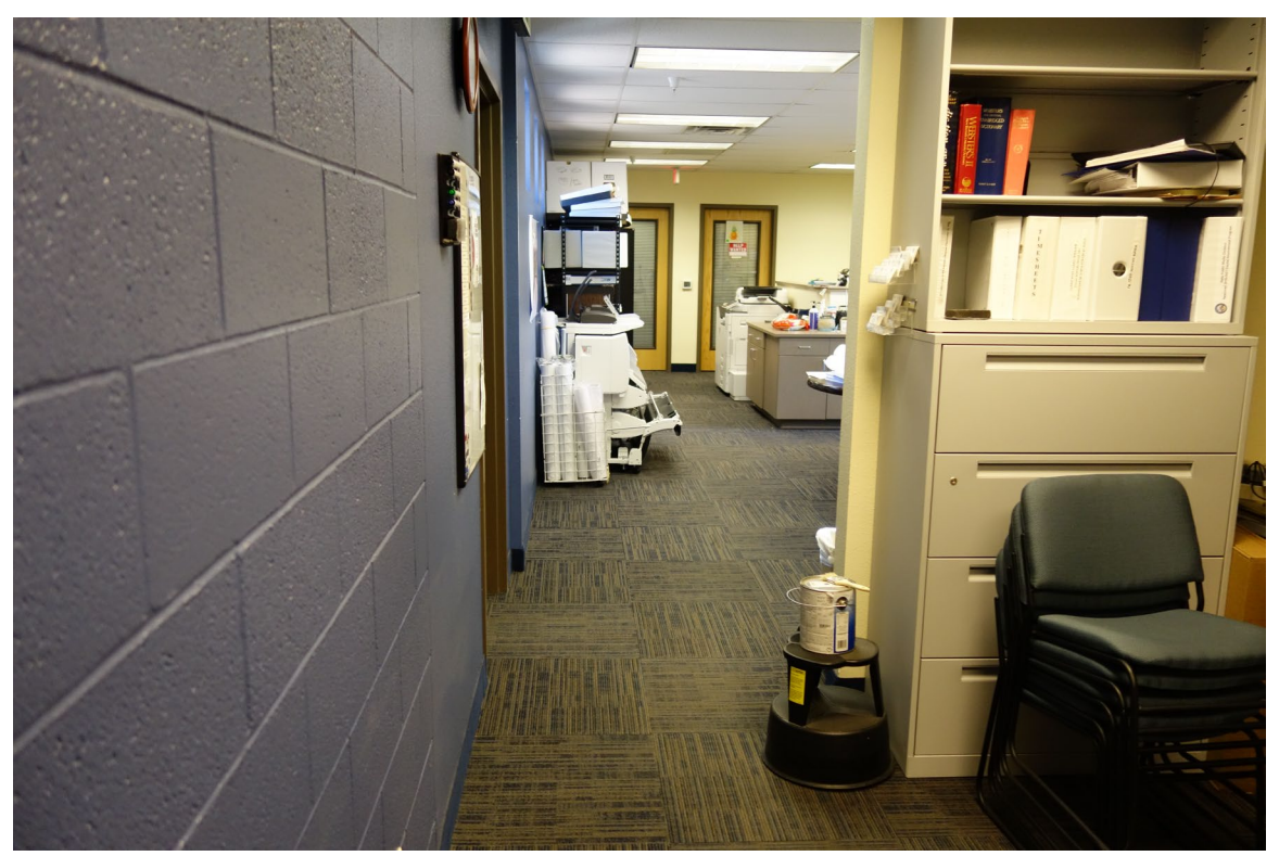
LV B&G – Public Works Office – FCA Building #0418 Description: View of Interior Office.