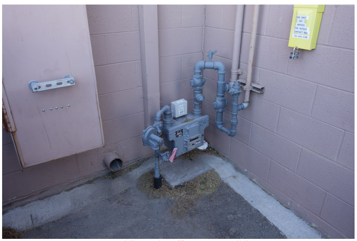
LV B&G – Public Works Office – FCA Building #0418 Description: Seismic Gas Shut-Off Valve Needed.