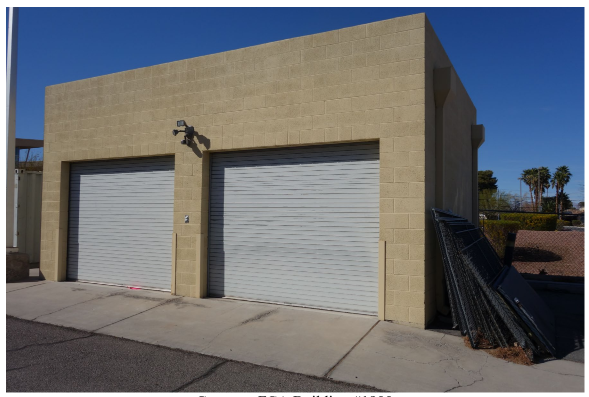
Garage – FCA Building #1900 Description: Exterior of the Building.