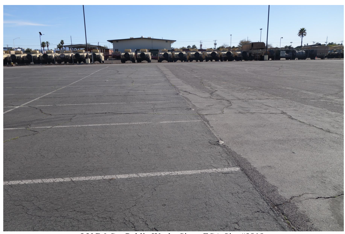
LV B&G – Public Works Site – FCA Site #9818 Description: Parking Area Crack Fill & Seal Needed.